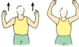
Arm slides on wall