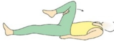
Single knee to chest stretch