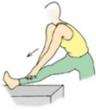
Standing hamstring stretch