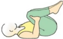
Double knee to chest