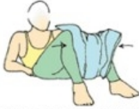
Sitting hip adduction isometrics