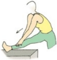
Standing hamstring stretch