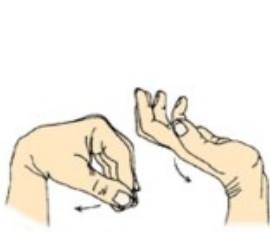
Wrist range of motion