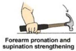
Forearm pronation and supination strengthening