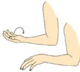
Pronation and supination of the forearm