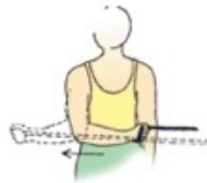
Tubing exercise for external rotation