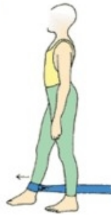
Resisted hip flexion