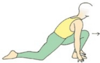
Hip flexor stretch