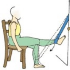
Elastic tubing hamstring curls