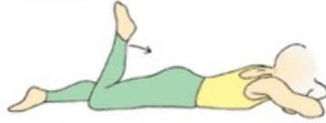
Prone knee bends