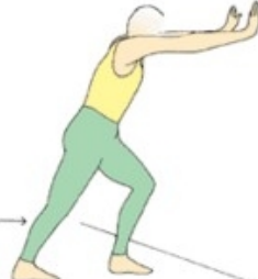
Standing calf stretch