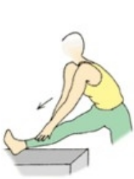
Standing hamstring stretch