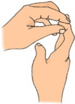
Passive range of motion