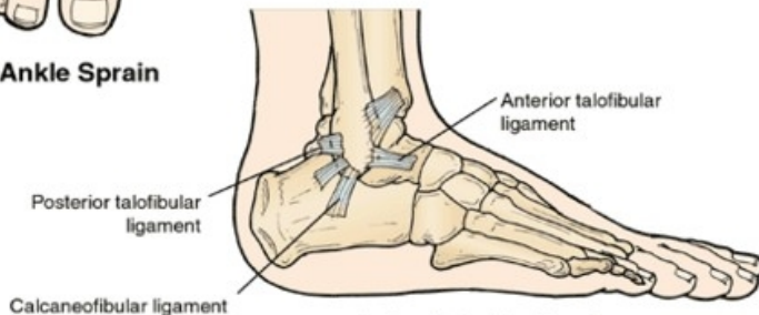
Lateral Ankle Sprain